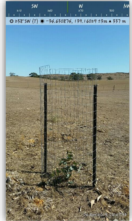
Figure 2 Location details photograph of paddock tree