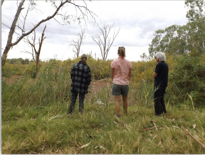
Figure 4 area north of Lock

29. Invoiced the council for the native vegetation assessment report that was submitted to the Native Vegetation Council, which has been approved.