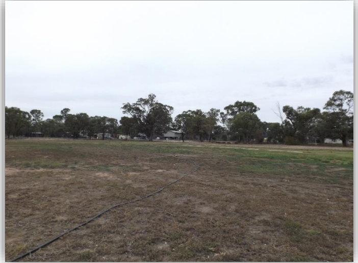
Figure 6 old oval surface

30. Site visit to Blanchetown to recommence the Sustainable Recreation Management Plan. The plan will focus on town entrance statement and landscaping at the medical centre, upgrading the oval and surrounds, north of the lock to improve river access.