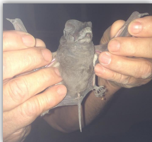
Figure 4 White-striped freetail bat