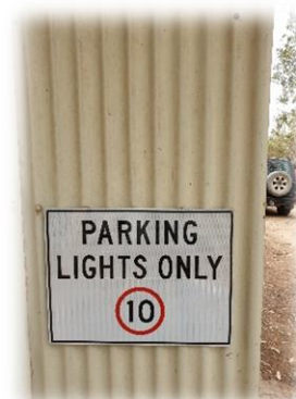
Figures 8 and 9 new directional and safety signage