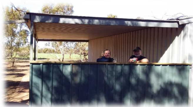
Figure 1 shelter area for BBQ's up at the back shed constructed by volunteers