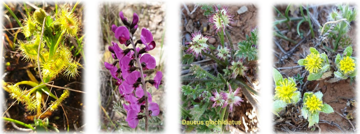
Figures 3, 4, 5, 6 Sundew, Swainsona, Native Carrot and Common sunray