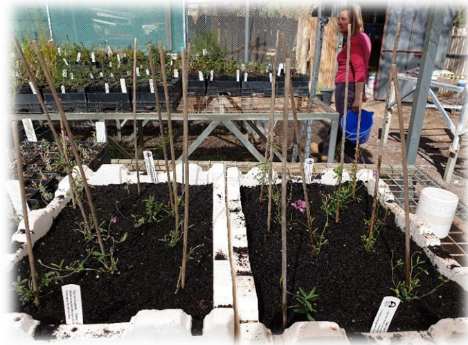
Figure 2 seed increase of grassland species