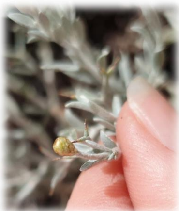
Figure 10 first flower from a plant originally grown from seed, second generation.