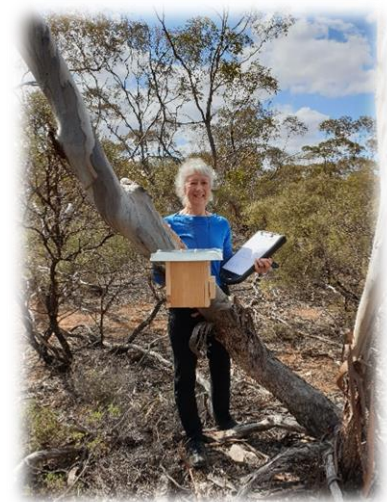
Figure 7 setting up possum boxes with landholder