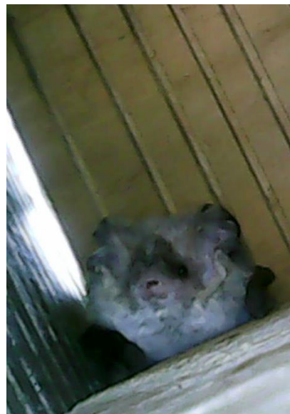
Figure 12 Inspecting bat boxes at Wildwood Park Sanctuary. Fig 13 Bat found in bat box at Lee's