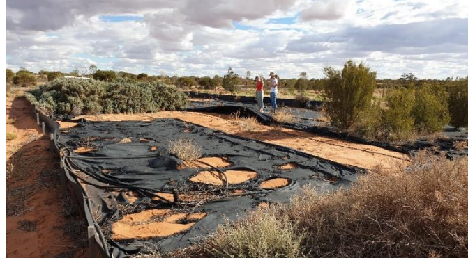
Figure 11 Frahn's SPA in need of repair.