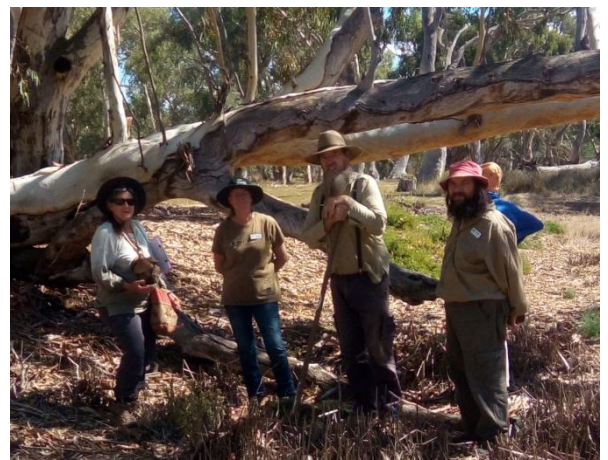
Figure 3 Volunteers at John Christian Reserve workshop