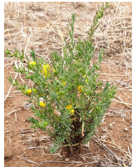
Figure 5 Ruby Saltbush in Meldanda trial site.