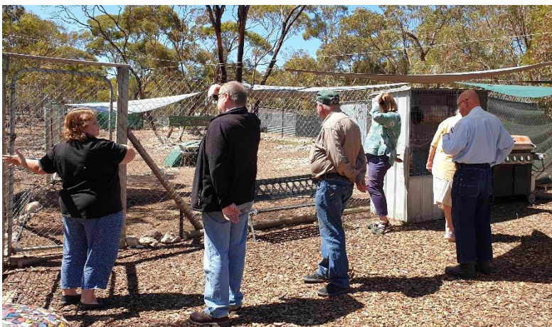
Figure 2 Committee meeting at Wildwood Park Sanctuary.