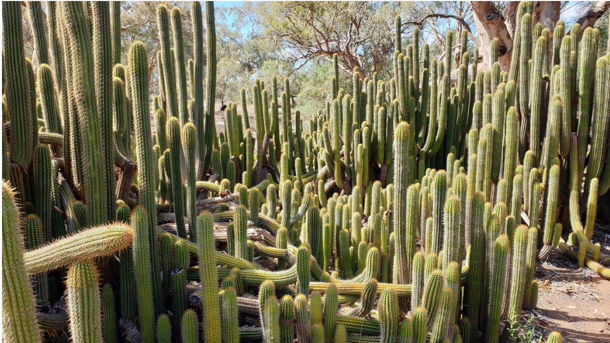
Figure 1 Cactus at Meldanda that needs to be controlled.