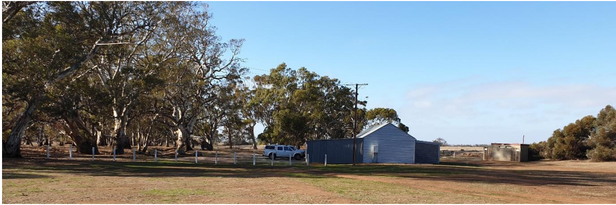
Figure 3 Towitta Park