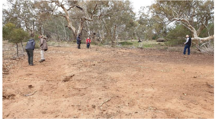
Figure 4 large cactus removed 22/06/21 thanks to MM Council.