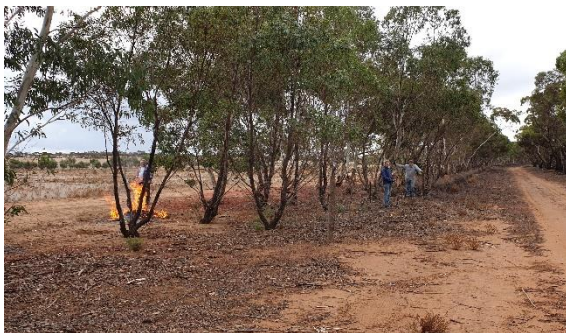
Figure 1 Clearing the fenceline of roly poly.