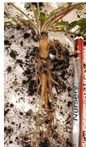
Figure 8 Ptilotus root