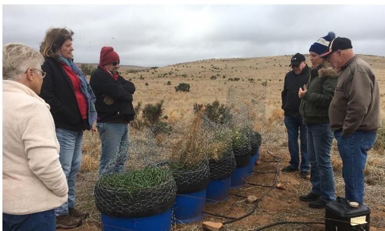
Figure 7 Wicking bed trial with Landcare Committee, photo by Helen Crisp.