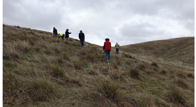
Figure 10 "Making Money Out of Grass" training day.