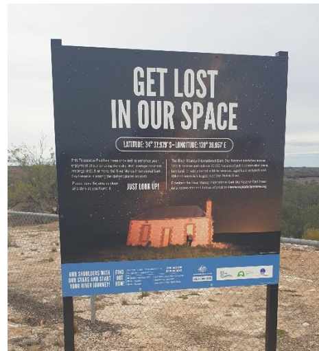
Figure 6 one of the new telescope pad signs by MMC