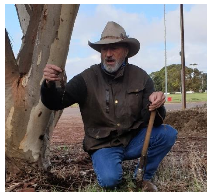
Figure 15 grass roots from under a tree