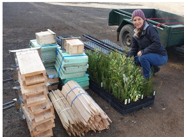
Figure 12 boxes, plants and guards dropped off for farmers.