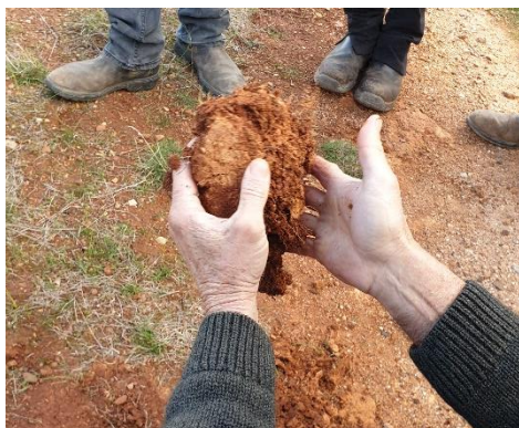
Figure 13 showing soil structure.