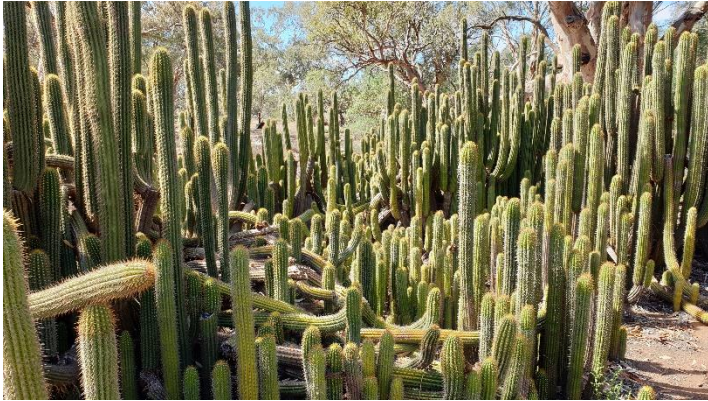
Figure 3 Large cactus at Meldanda alongside Marne 09/03/21

to the Marne. They did an amazing job, especially so close to the river's edge. The volunteers have been over the site and collected any small fragments they could find to dispose of. We will monitor the site regularly and get any seedlings when they germinate, see before and after photos below.