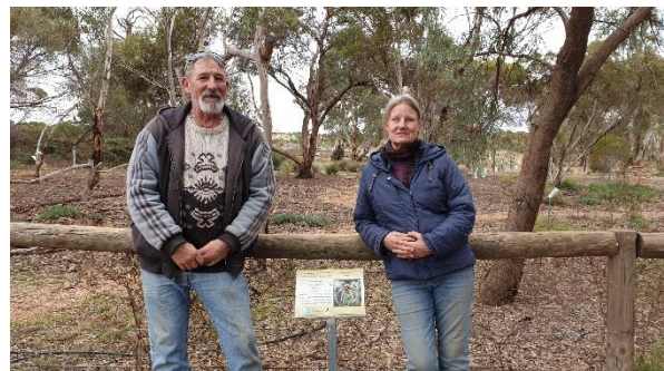
Figure 2 new bushtucker signs installed.