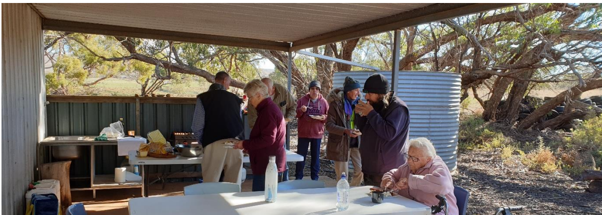
Figure 4 Volunteer BBQ at the Meldanda back shed.