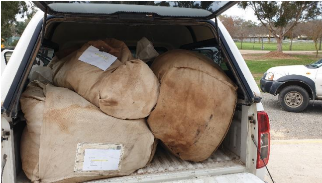
Figure 9 Ute load of seed for trials from Succession Ecology