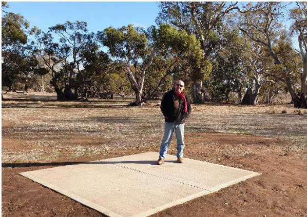
Figure 5 new telescope pad installed at Towitta Park by MMC