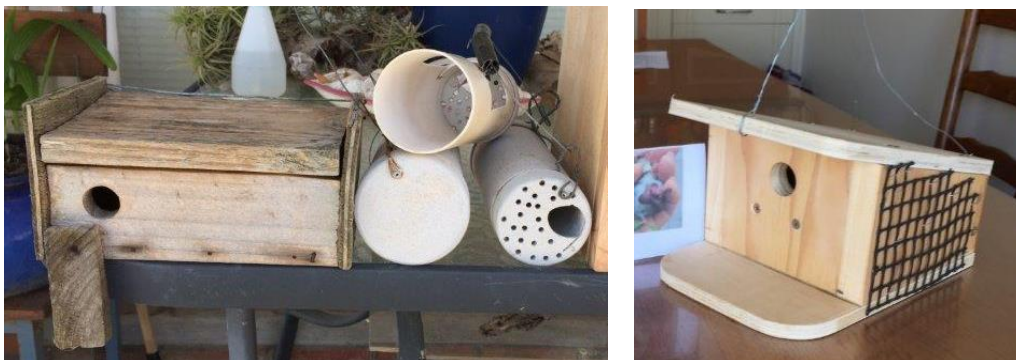
Figure 4 nest box designs provided by Ann Williams