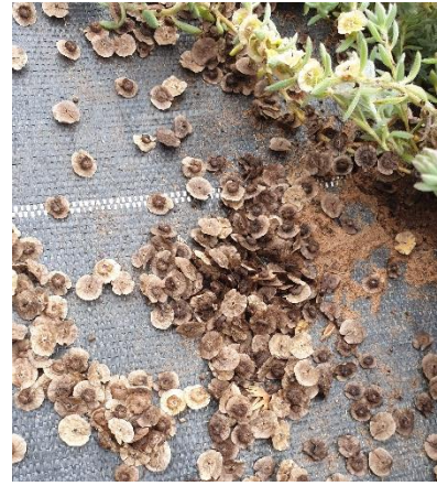
Figure 2 Maireana excavata seed