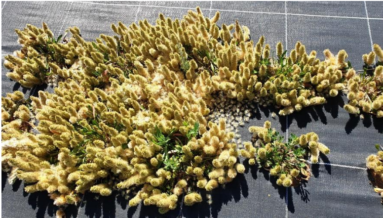
Figure 1 Ptilotus spathulatus starting to set seed.