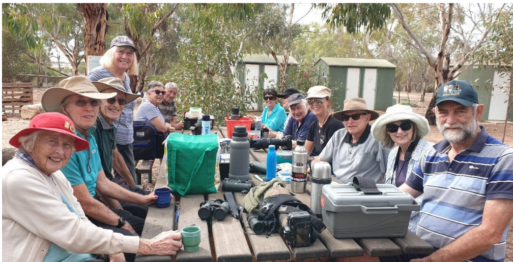
Figure 1 Riverland Field Naturalists Club, Meldanda tour