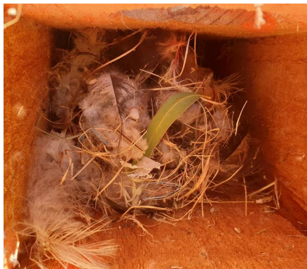
Figures 2and 3 the parrot box that fell and the nest inside