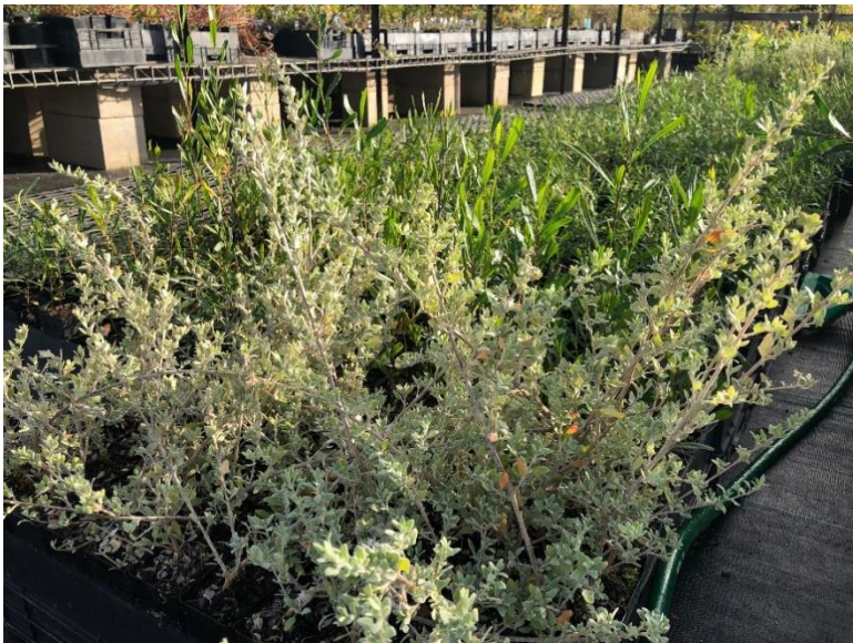
Figure 3 and 4 Seedlings ready to be batched up at Riverland Native Plants

23. On 24 th June Aimee and Rowena went up to Wilabalangaloo and Riverland Native Plants to batch up over 7000 seedlings grown by these nurseries. With help from Tim Field, we got all the seedlings batched up and ready for landholders to pick up for their revegetation projects.