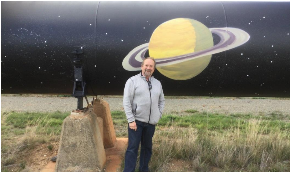
Figure 4 One of the planets on the Pipeline mural.