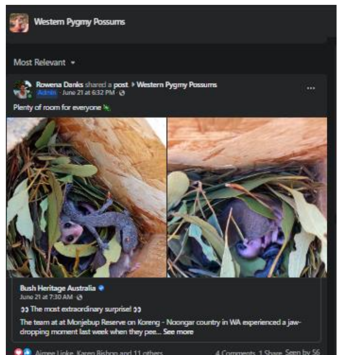
Figure 7 WPP share boxes with geckos