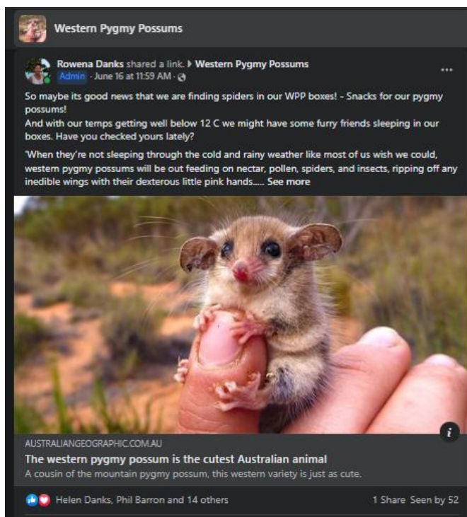
Figure 6 WPP eat spiders