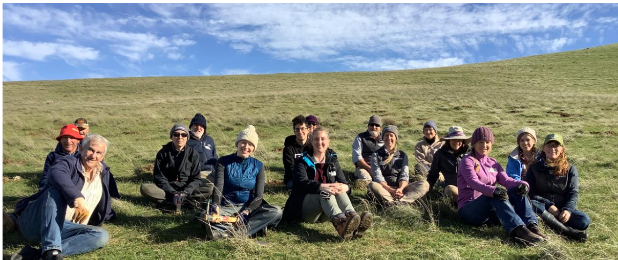
Figure 5 some of the planting crew at Tiliqua