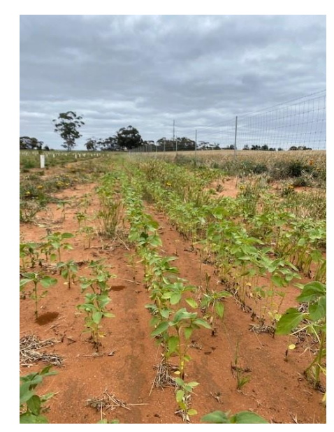
Figure 3 Almond Board site crop at Mid November