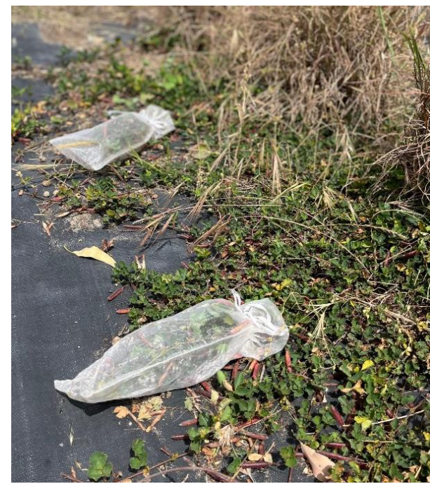
Figure 11 Kennedia prostrata with seed bags ready