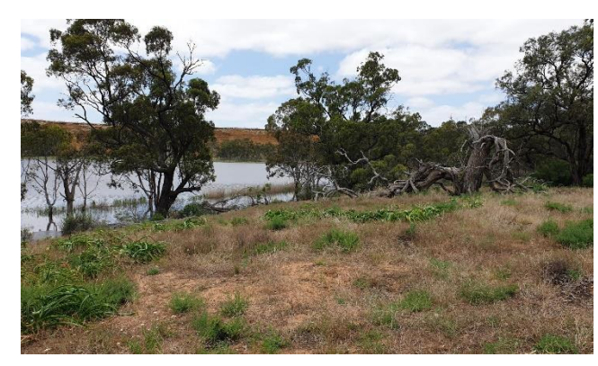
Figure 13 potential nesting ground surveyed, Henley Park.