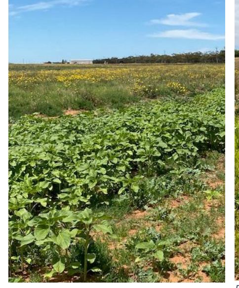
Figure 4 Pomona Farms Sunflower decoy crops