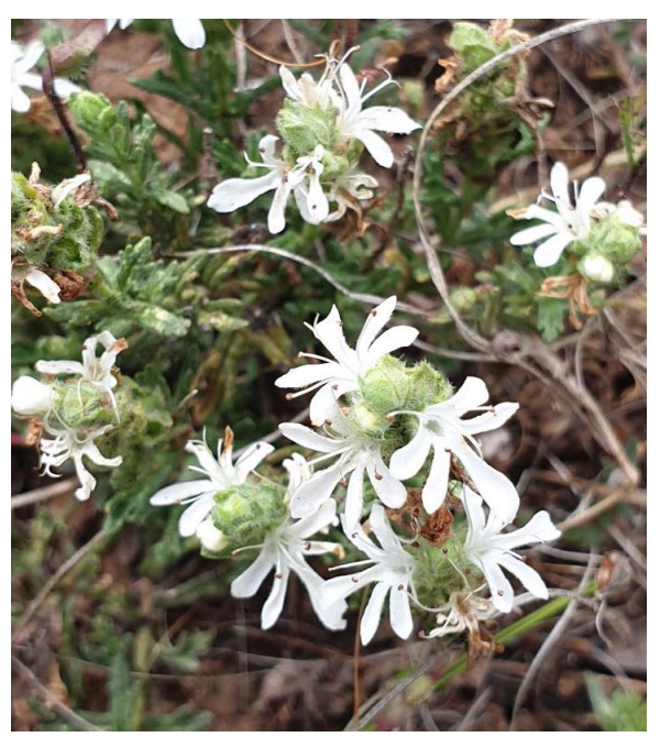
Figure 2 Teucrium sessiliflorum, rare plant