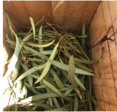
Figure 5 leaves in WPP box near Bowhill