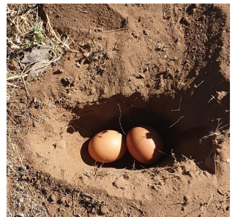
Figure 11 buried eggs.