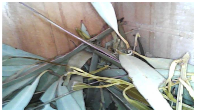
Figure 4 Point Yorke Box