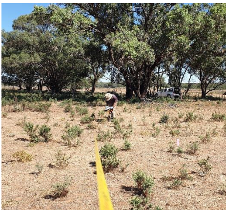
Figure 6 marking out nests at Big Bend.