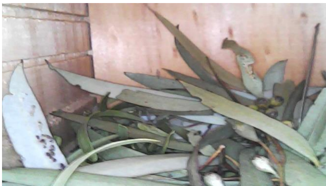
Figure 6 Sleeper Track Box