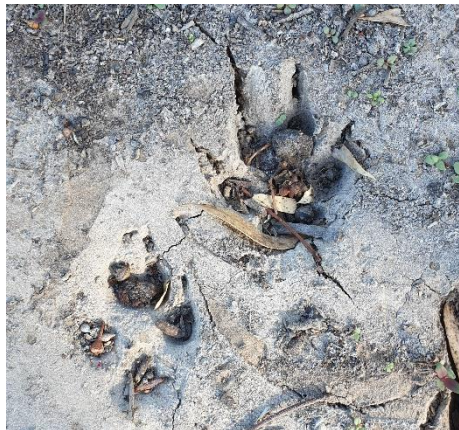
Figure 10 fox prints,