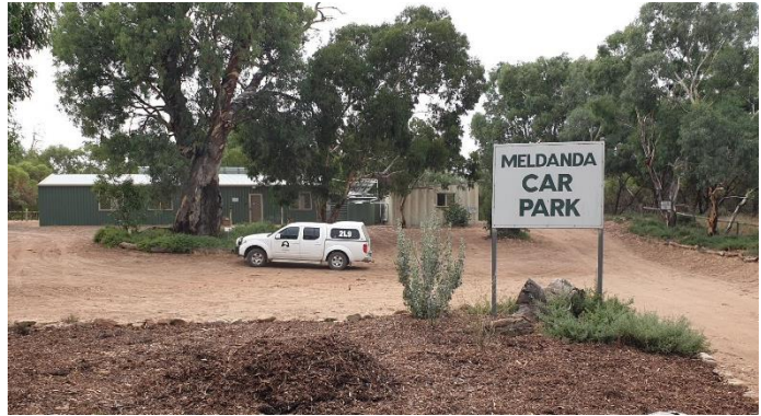
Figure 2 Meldanda Carpark