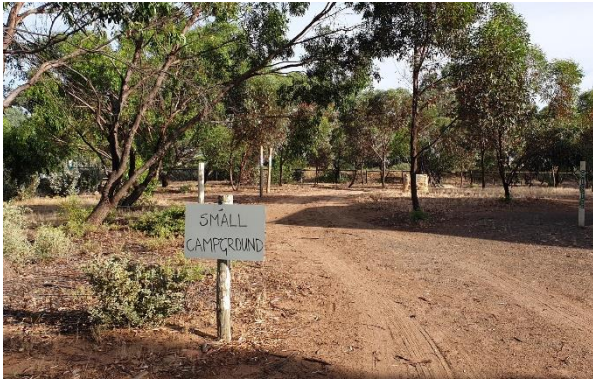
Figure 1 Small campground