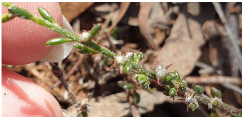
Figure 1 Mallee copperburr, Sclerolaean parviflora .