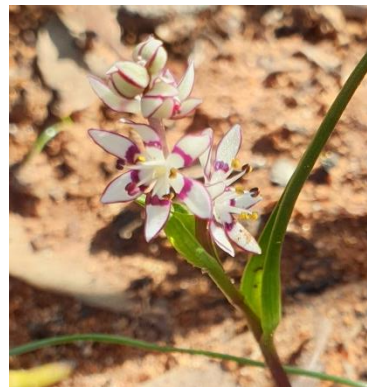
Figure 2 Early Nancy, Wurmbea dioica