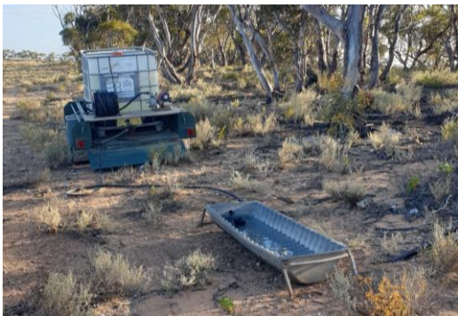
Figure 6 water point set up.