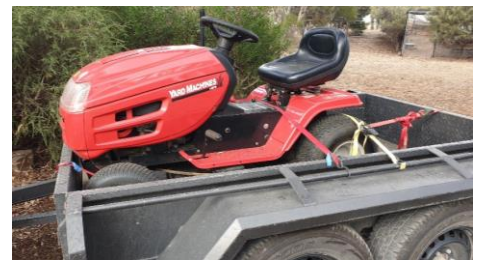
Figure 3 second hand mower.