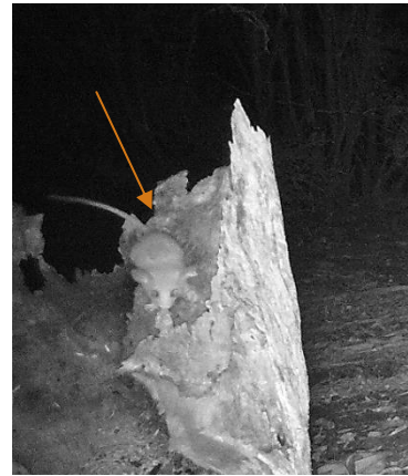
Figure 5 Coral Johnston's possum photo.