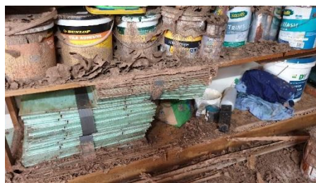
Figure 2 white ants destroyed cupboard.