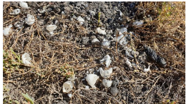
Figure 9 predated turtle nest.