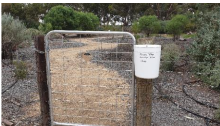
Figure 1 caltrop buckets at gate.