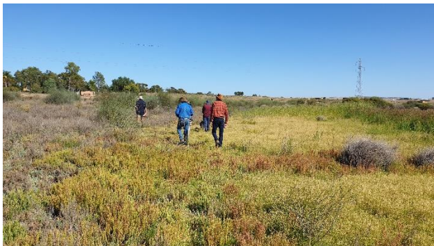
Figure 8 site visit nesting site Caloote.