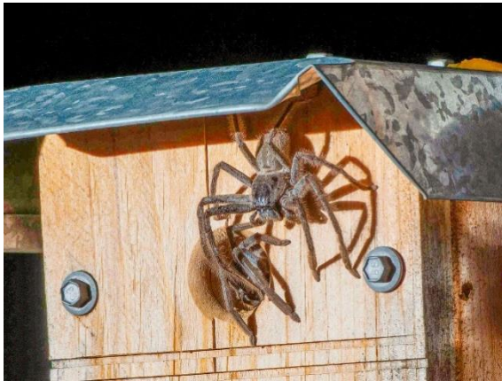
Figure 4 Spiders co-habit with possums.