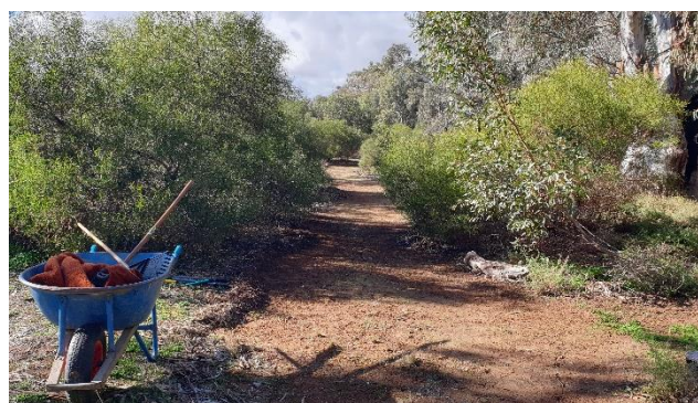
Figure 7 Clearing paths at Meldanda.