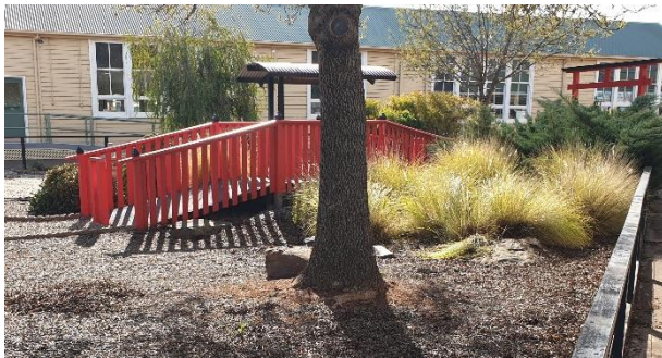
Figure 4 Fountain Grass before weeding.