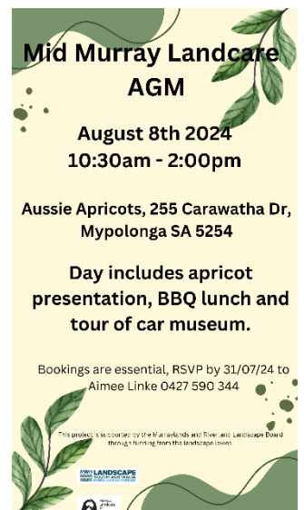
Figure 1 AGM Flyer