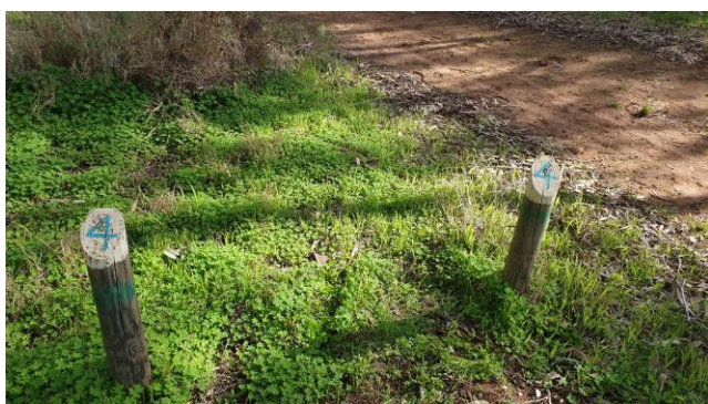
Figure 6 Disc Golf Tee posts.