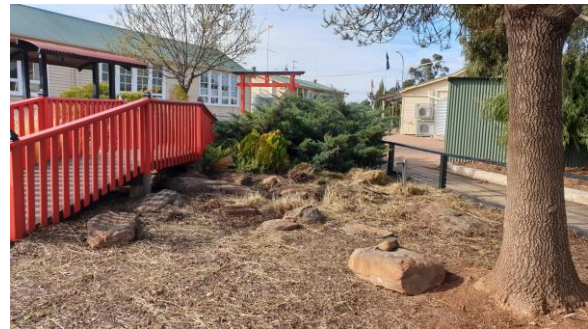
Figure 5 Fountain Grass after weeding.