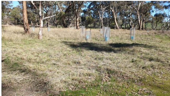
Figure 2 Keyneton Nature Reserve after some whipper snipping.