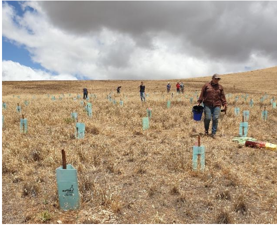
Figure 3 volunteers watering Tiliqua plantings.