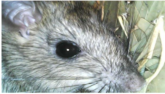
Figure 1 Rattus sp. occupying WPP box.