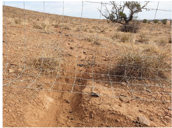
Figure 4 kangaroo pushed under the stiff stay fence.