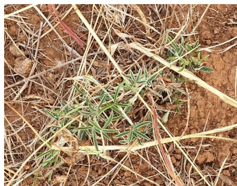
Figure 8 Glycine rubiginosa .