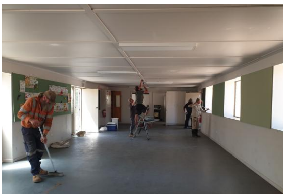
Figure 2 Volunteers preparing Recreation Hall for painting.