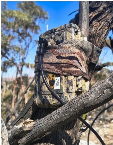
Figure 4 Bat detector deployed.