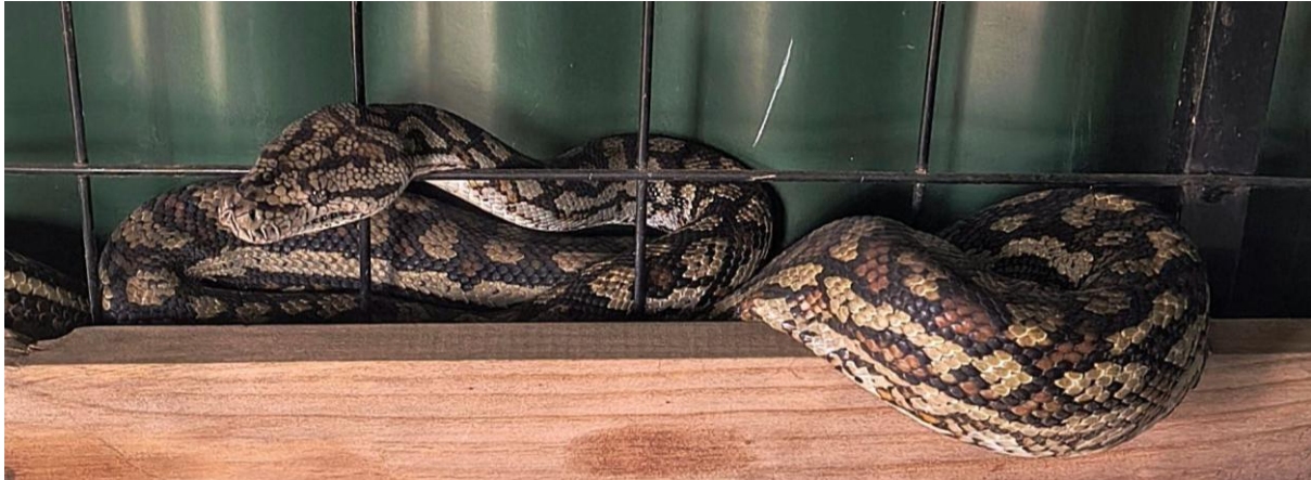
Figure 6 Murray Darling Carpet Python