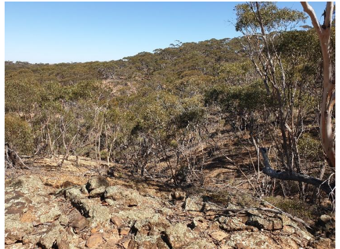
Figure 1 Property visited near Ridley CP.