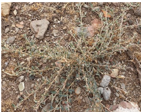
Figure 7 Atriplex semibaccata setting seed.